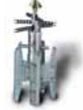
Chain centrifugal cleaner